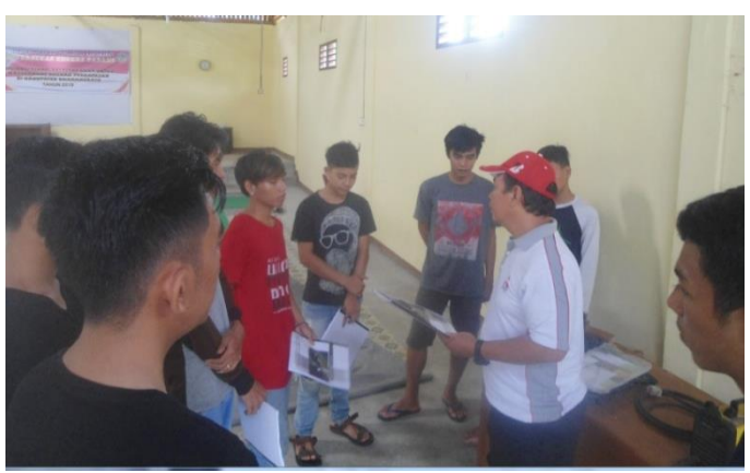
Fig. 5. Distribution of Welding Modules to Participants