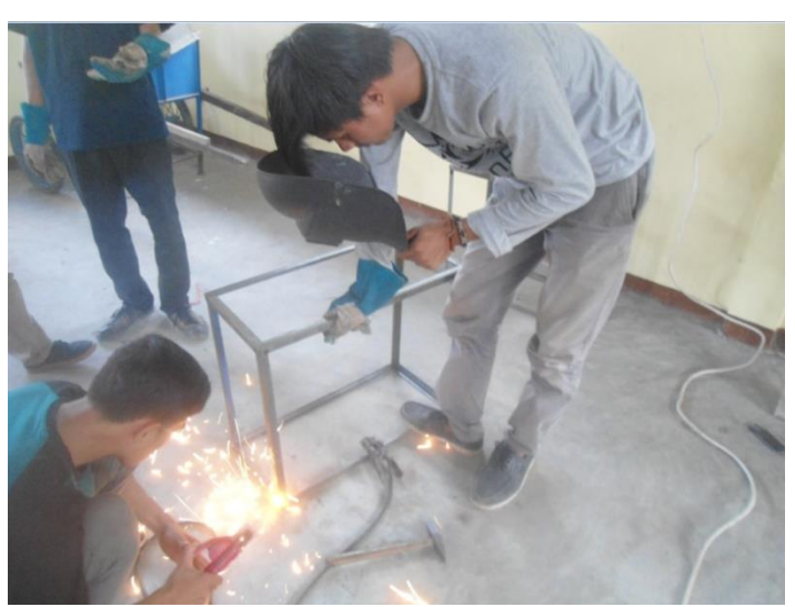
Fig. 12. The team guides participants in making products