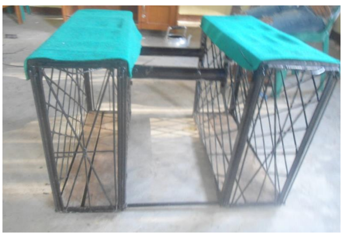
Fig. 14. The final product

On the third day, the TEAM provided direction on how to welding entrepreneurial opportunities. The head of the service with TIM asked the kenagarian to be able to accommodate the birth of new entrepreneurs for youth who could make independent and productive people