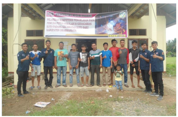
Fig. 15. Group photos after the welding competency training ends

On the third day, the TEAM provided direction on how to welding entrepreneurial opportunities. The head of the service with TIM asked the kenagarian to be able to accommodate the birth of new entrepreneurs for youth who could make independent and productive people