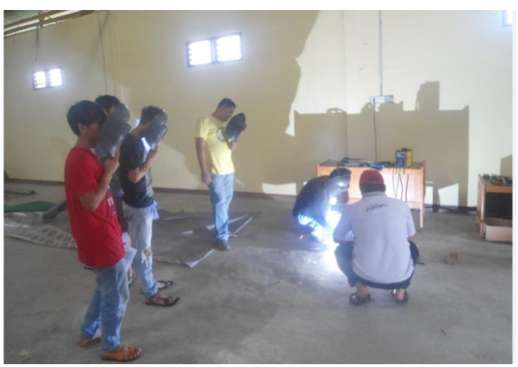
Fig. 9. One of the participants practised welding guided by the lecturer