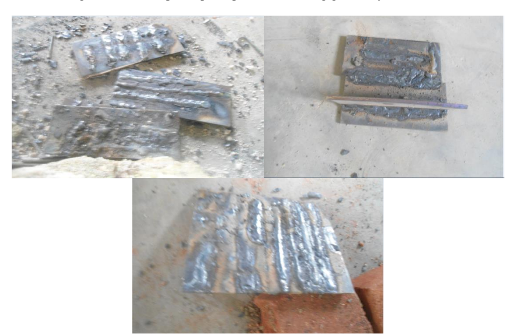
Fig. 10. Welding results of the participants on the first day

On the second day, the speakers began to invite participants to design products that could be made through welding activities in accordance with the needs of the community. In this activity, TIM directs to make a cage. TEAM began to guide participants in the process of making cages.