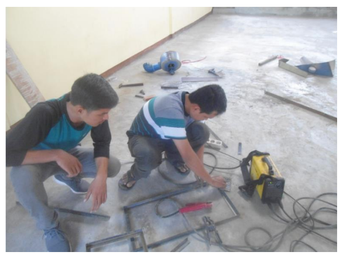
Fig. 11. The team designs and is noticed by the participants