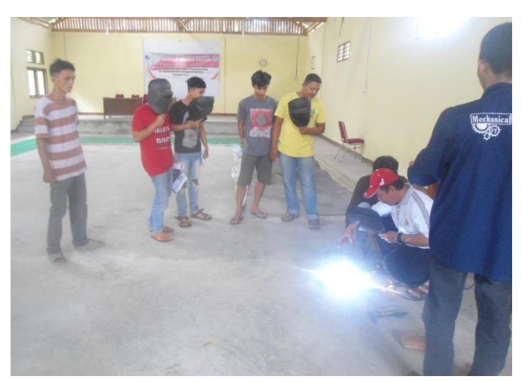
Fig. 8. The lecturer immediately practised welding techniques on the media