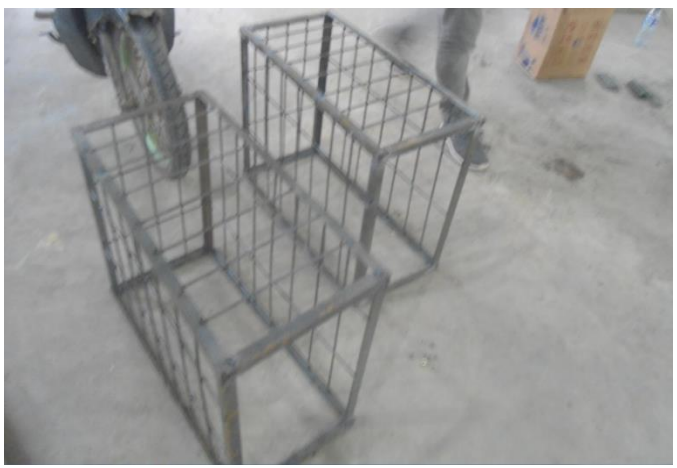
Fig. 13. Semi-finished products