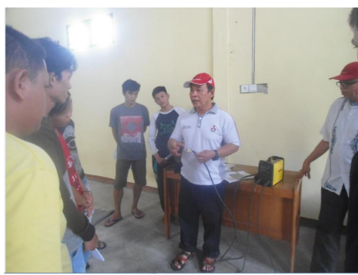
Fig. 6. One of the lecturers gave a briefing on welding tools