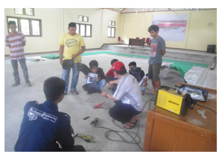
Fig. 7. The lecturer provides guidance on basic welding techniques