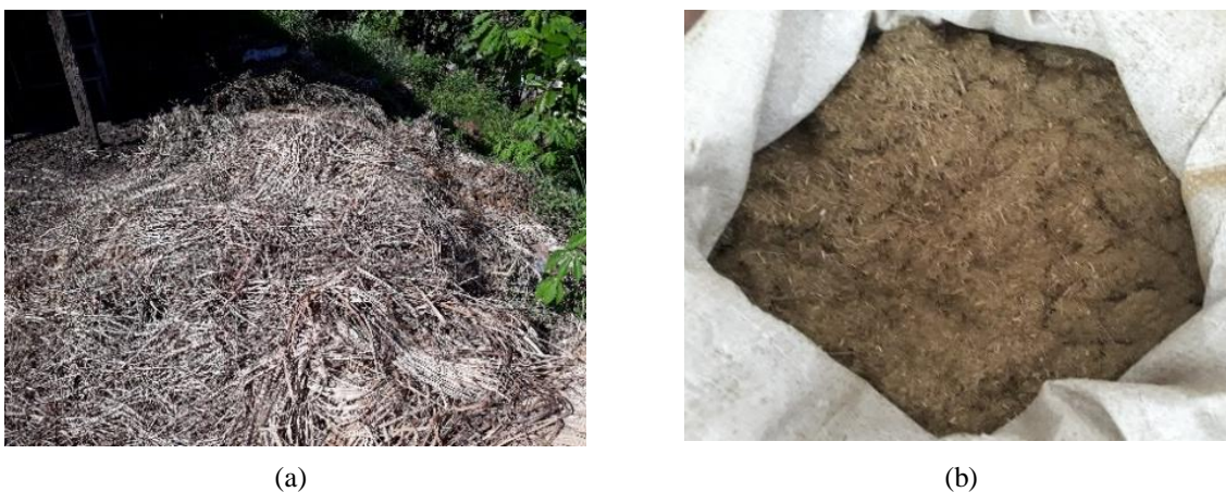
Figure 1: (a) Cymbopogon citratus waste and (b) Cymbopogon citratus particles

In this study, an experimental study was conducted on the characteristics of the briquette test sample. The orientation of the implementation of this research is focused on obtaining the characteristics of Cymbopogon citratus waste briquette fuel. The research raw materials were taken from lemongrass waste after the Cymbopogon citratus (lemongrass) oil extraction process was carried out (Figure 1). The adhesive used in the manufacture of Cymbopogon citratus briquettes is tapioca (Figure 2). The method of making Cymbopogon citratus briquettes is by percentage of the main raw material mixture to the adhesive, namely 90%: 10%, 80%: 20%, 70%: 30%, 60%: 40%. Then followed by testing activities in the laboratory for each test sample produced. In addition to these activities, work will be carried out before hand for the manufacture and development of auxiliary equipment needed for the briquette manufacturing process, as well as an inventory of raw material needs and the availability of fittings.