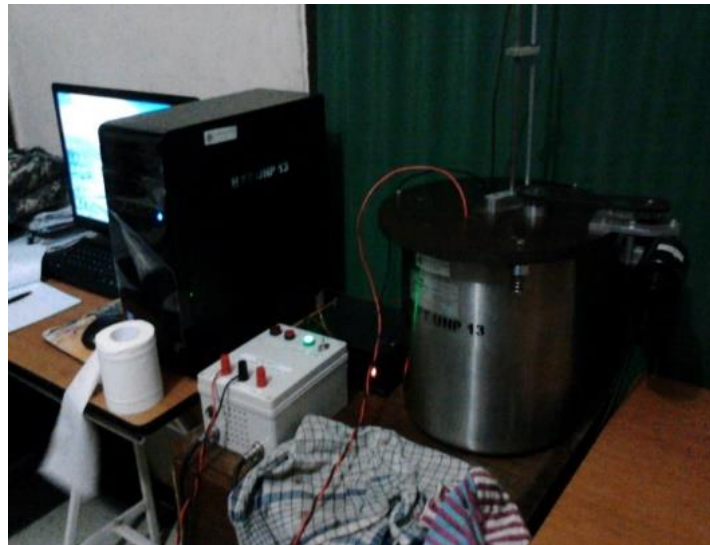
Figure 3: Bomb calorimeter apparatus

In carrying out this research, the availability and procurement of laboratory test equipment is required. The prototype of the lemongrass briquette obtained was subjected to further testing and treatment as well as selection. Tests that are very urgent, especially those related to the heat energy of combustion or calorific value by using the "Bomb Calorimeter" apparatus (Figure 3).