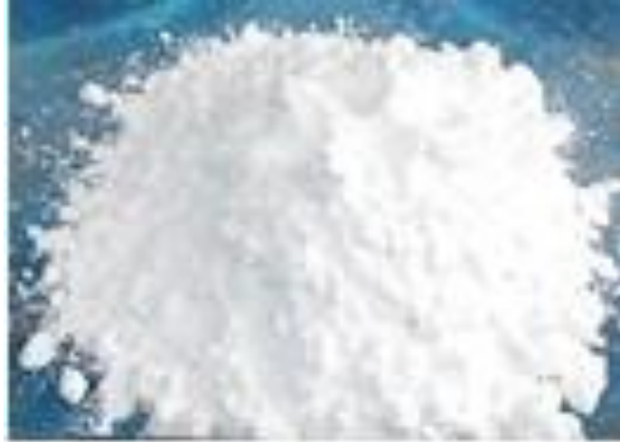
Figure 2: Tapioca adhesive

In carrying out this research, the availability and procurement of laboratory test equipment is required. The prototype of the lemongrass briquette obtained was subjected to further testing and treatment as well as selection. Tests that are very urgent, especially those related to the heat energy of combustion or calorific value by using the "Bomb Calorimeter" apparatus (Figure 3).