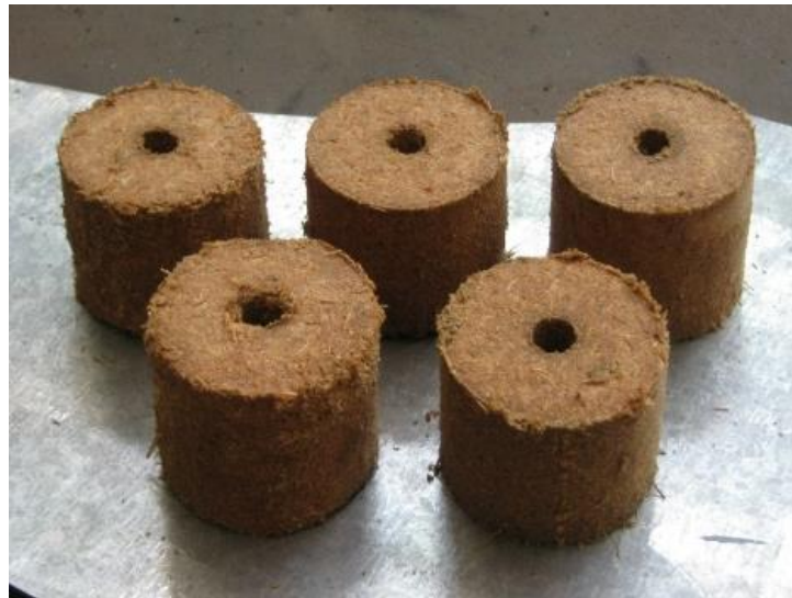
Figure 4: Cymbopogon citratus (Lemongrass) briquettes

In this study, as many raw materials as possible were prepared for the manufacture and printing of Cymbopogon citratus briquettes. The need for research raw materials in the form of Cymbopogon citratus pulp is calculated by predicting the number of variations of the mixture with tapioca adhesive. According to the line of thought presented in the research methods section, along with the work according to the technical briquette making so that several physical prototypes are obtained as a result of the manufacturing product. Figure 4 shows a briquette product produced from Cymbopogon citratus (Lemongrass) waste. Based on the procedure in the test using the Bomb Calorimeter, calorific values for the resulting prototype is as shown in Figure 5. The values obtained for a number of physical quantities i.e density and percentage optimum is as shown in Figure 6. The calculation which is conducted based on a standard formula derived by entering data from the measurement results on the test equipment used.